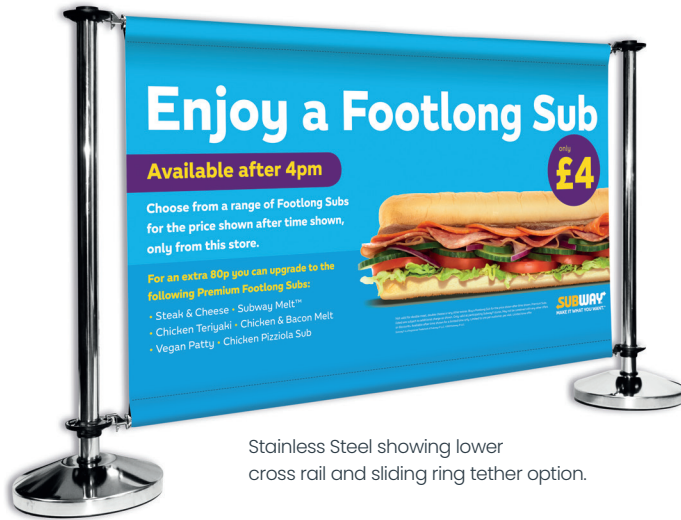
Stainless Steel showing lower cross rail and sliding ring tether option.

Stylish, strong and effective – Adfresco® Café Barriers create the perfect space for your customers and brand. Available in polished Stainless Steel or Satin Black.