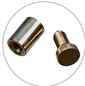
Brass (Plated Gold)