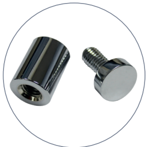
Aluminium (Chrome Plated)