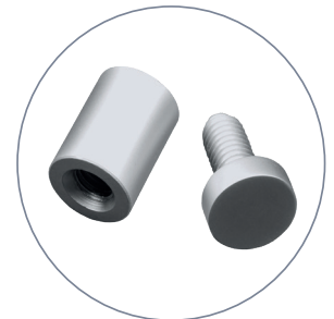
Aluminium (Satin Silver)