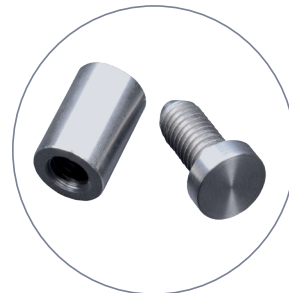
Stainless Steel (321 grade, brushed)