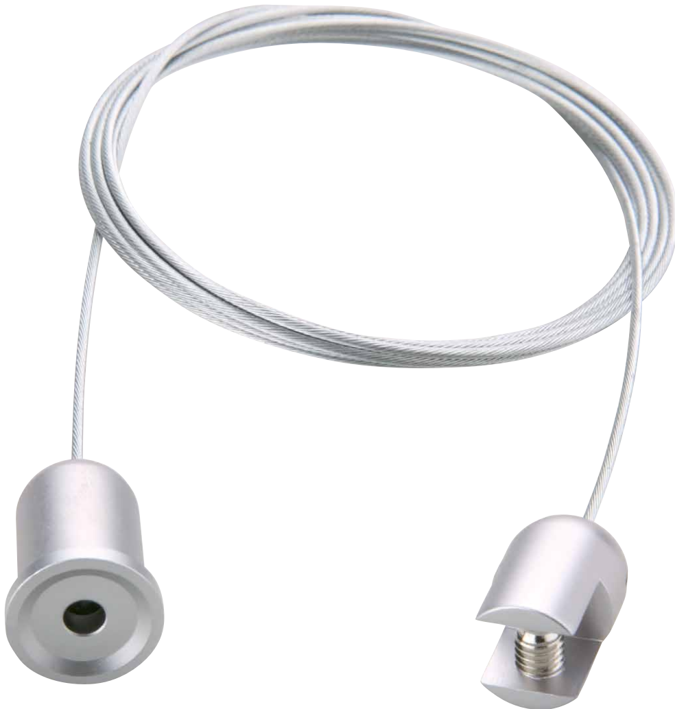
Satin Chrome Suspended Cable With Ceiling To Sign Fixings